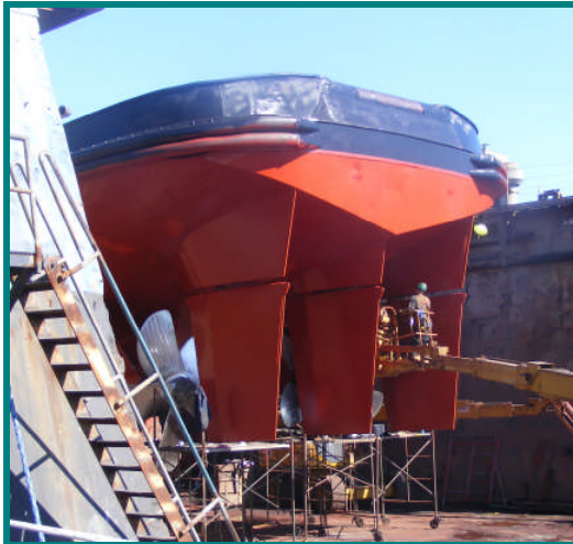
Sher-Release Fouling Release Red Silicone