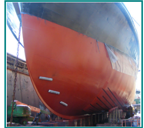
Sher-Release Fouling Release Red Silicone