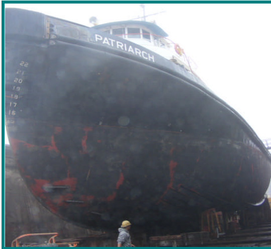
Prior to surface preparation and coatings